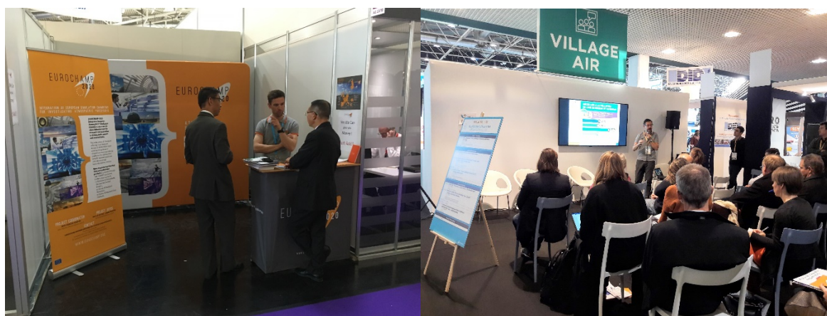
Figure 2. Engaging with potential industry users at Analytica (left) and Pollutec (right).