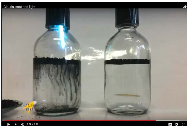
Figure 2: View of the "Clouds, soot and light" movie